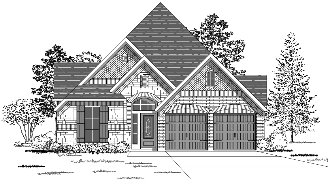
Design 2714W E-30

*See Page 3 for Details and Disclaimers. © Perry Homes, LLC 2014