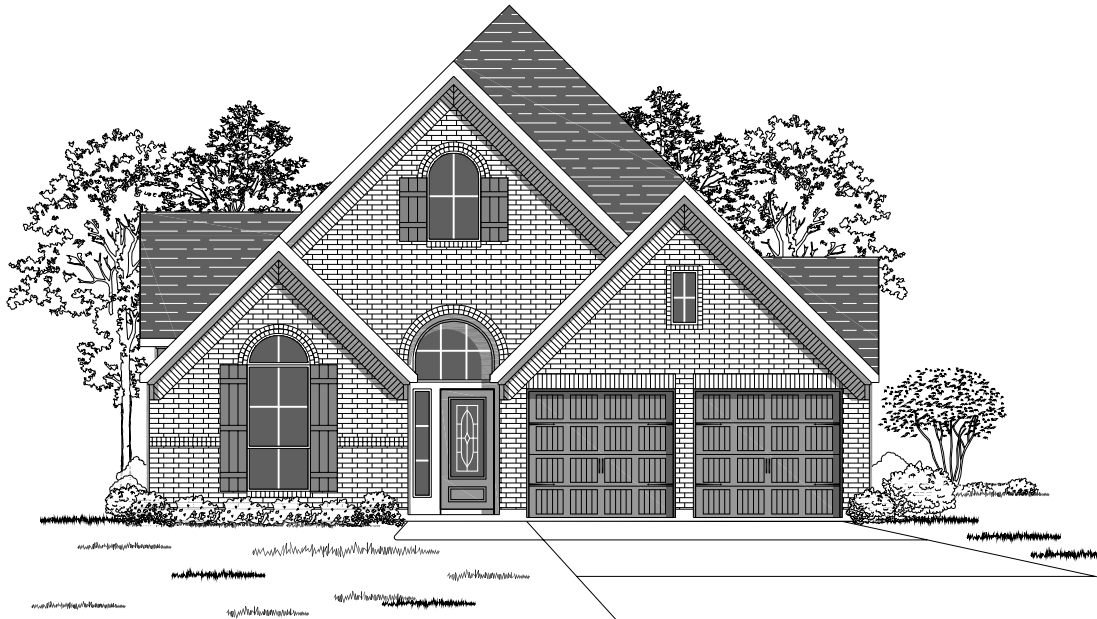
Design 2714W E-1