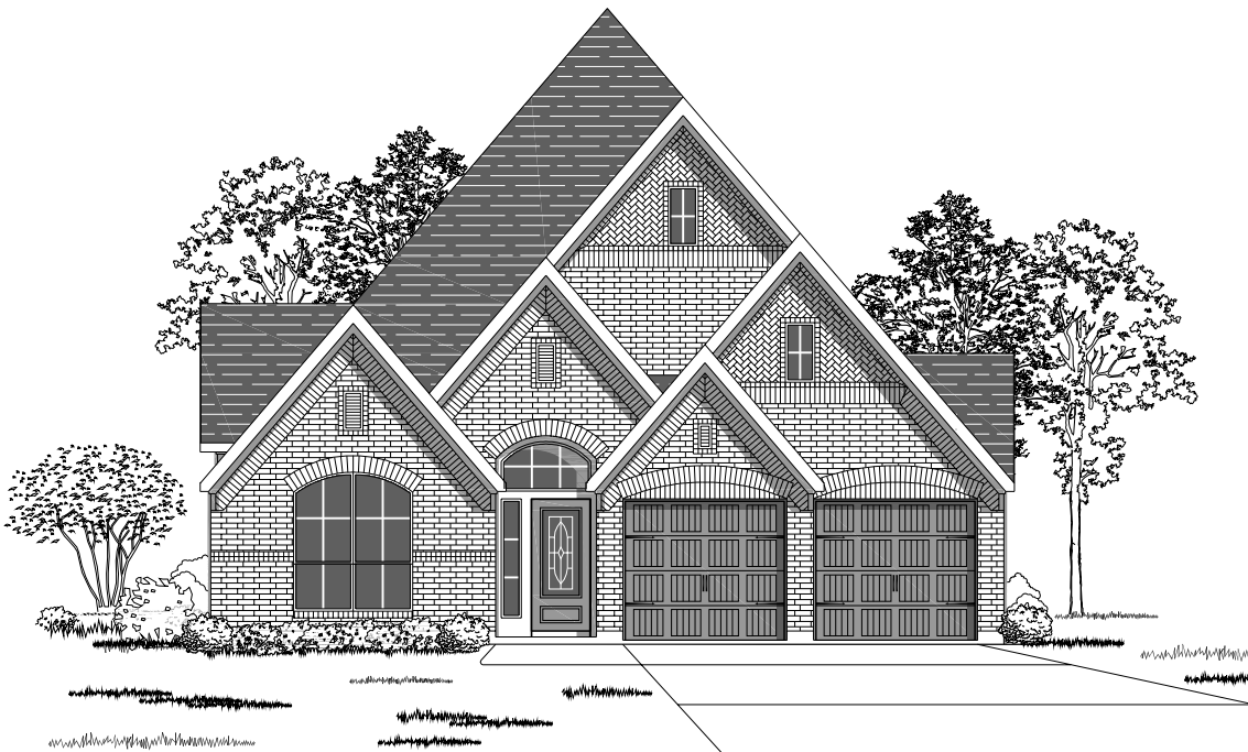
Design 2714W E-31